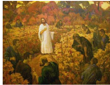
The Tenants in the Vineyard Matthew 21: 33-46